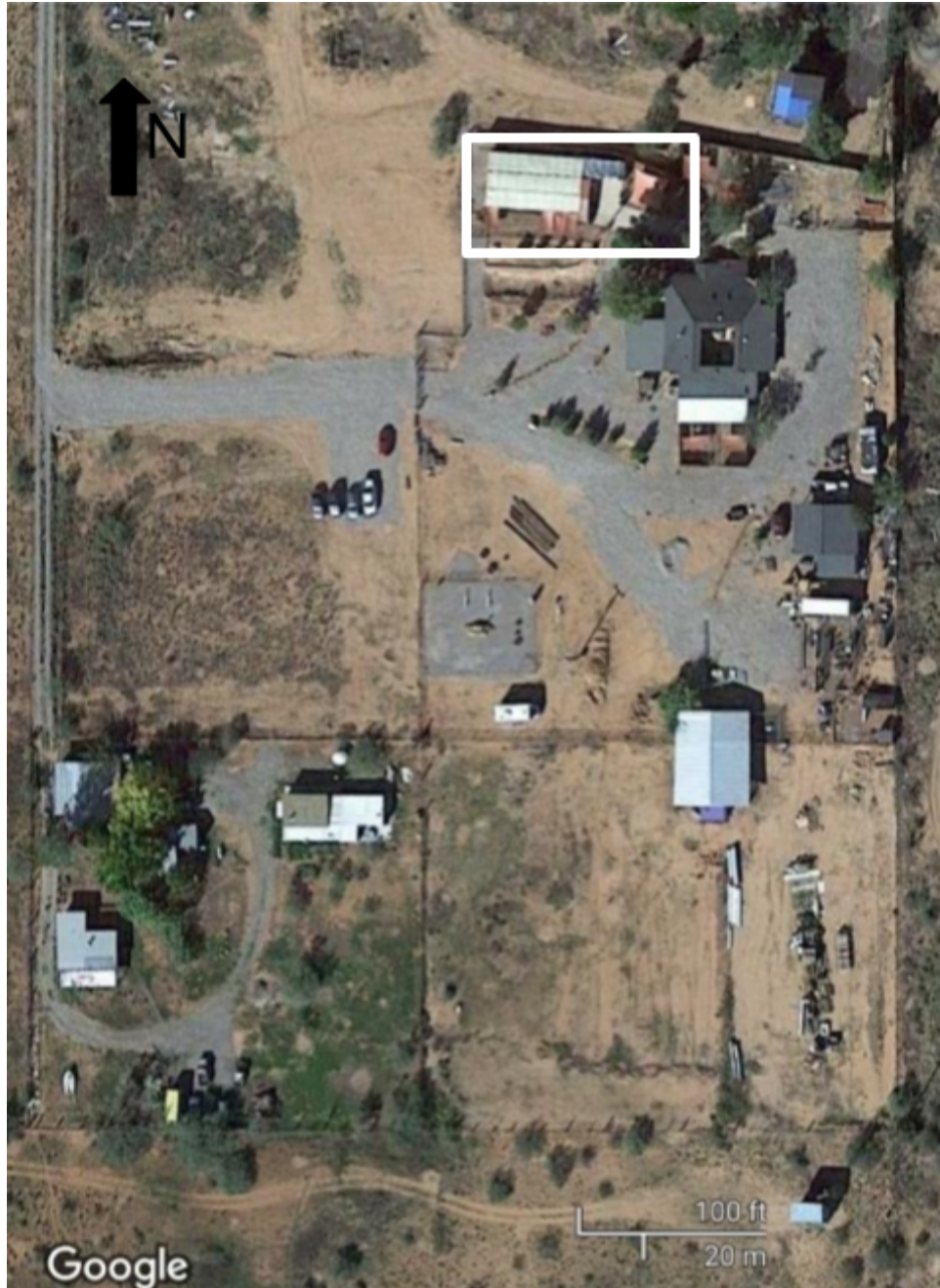
Figure 1-4: Aerial view of the project site. The outlined area highlights the project location at the site.

The project area is approximately 250 yards squared. The area is already developed to accommodate the dogs on the property. The site currently has 10 kennels, with dimensions 10 foot by 10 foot each. The spacing is five kennels on each side with approximately 8 foot walk path in between.