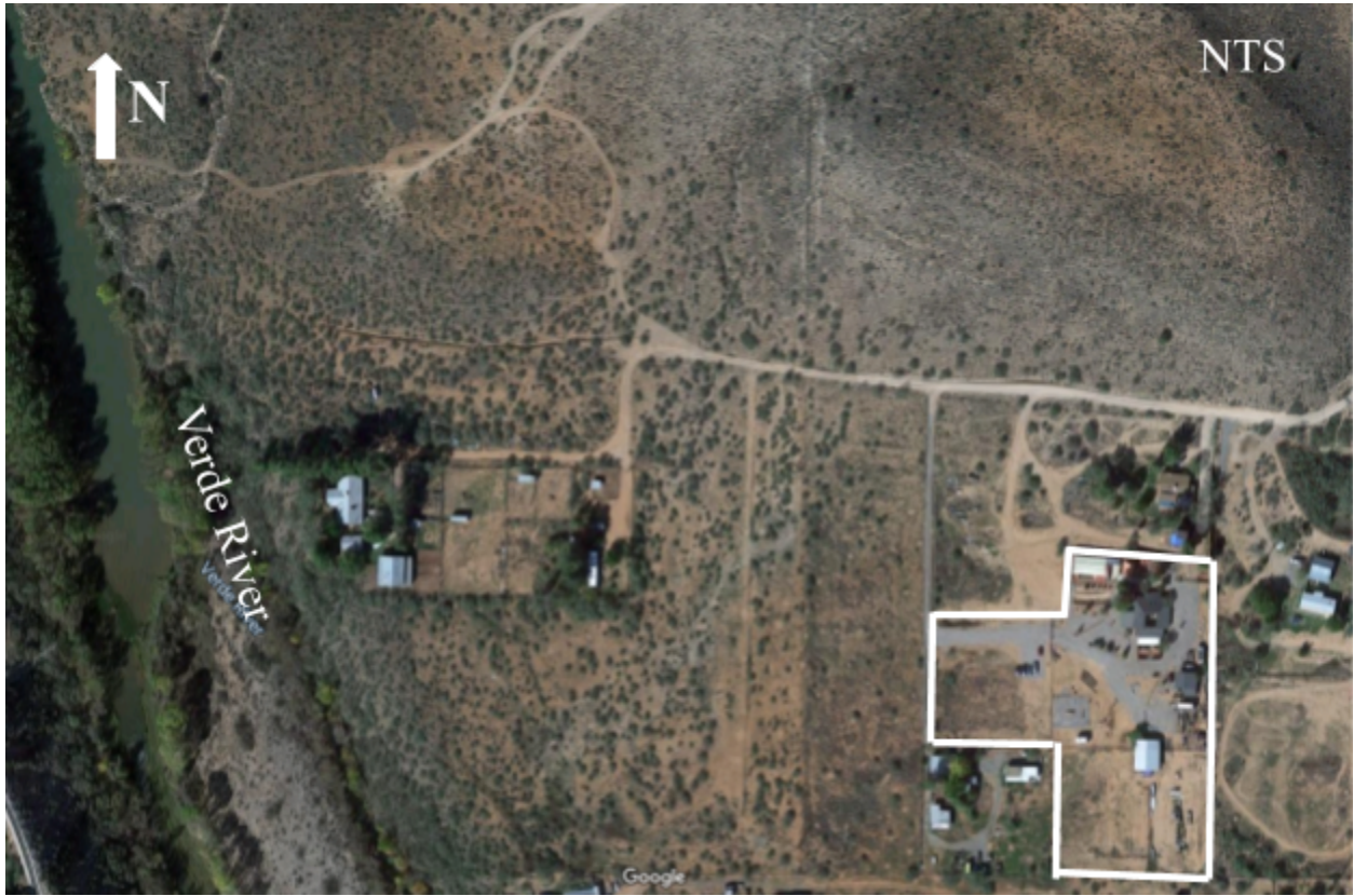
Figure 1-3: Aerial view of project site in relation to Verde River. The entire site is outlined in a red box.