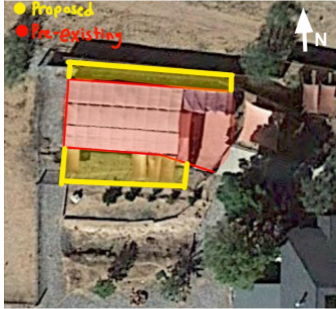
Figure 1-5: A visual of the project site's pre-existing development (red) and the available space (yellow) for the site design.